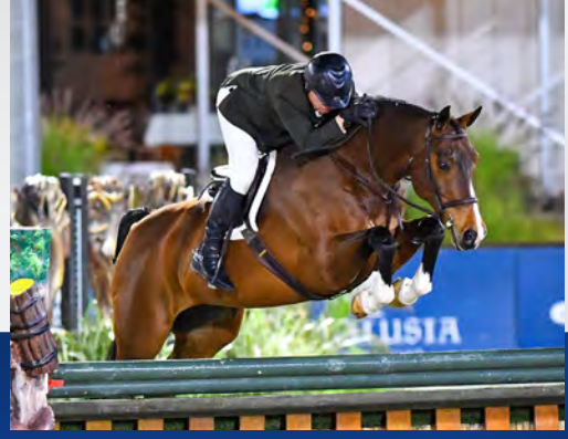
HIGH DESERT SPORT PHOTO