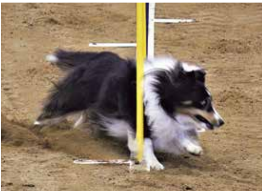
The Star City Canine AKC Agility Trials , held in Waldron Arena, offer a fun and fast-paced event by dogs of all breeds.