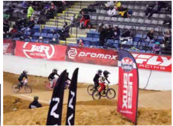
USA BMX Blue Ridge Nationals competition hosted again by VHC, transformed Waldron Arena into a meticulously groomed racetrack and filled the stands with fans of all ages from 39 different states.